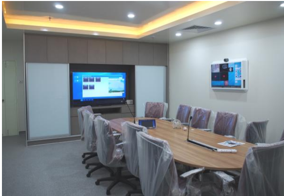
Conference Room (55" screen & 17" monitor)