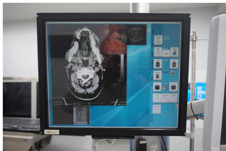
17" supervisory control console @ Pendant