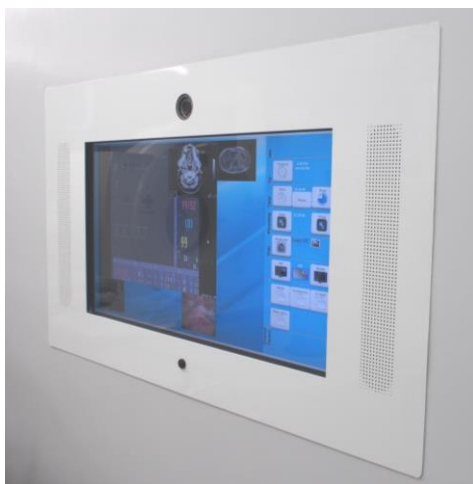
42" Wall Console Consist of touch console, integrated mic, speakers and camera for the purpose of medical conferencing