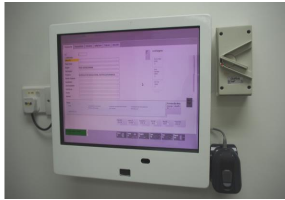
Nurses Module (Patient data and demographics, Surgeon and procedure, Inventory utilized & Incident report)