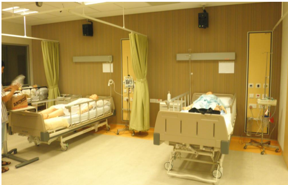
* Vertical Bed Head Panel with great flexibility & adaptability. Modern and meeting ID design

TÜV Rheinland certified company for ISO 13485 & CE0197 Marking